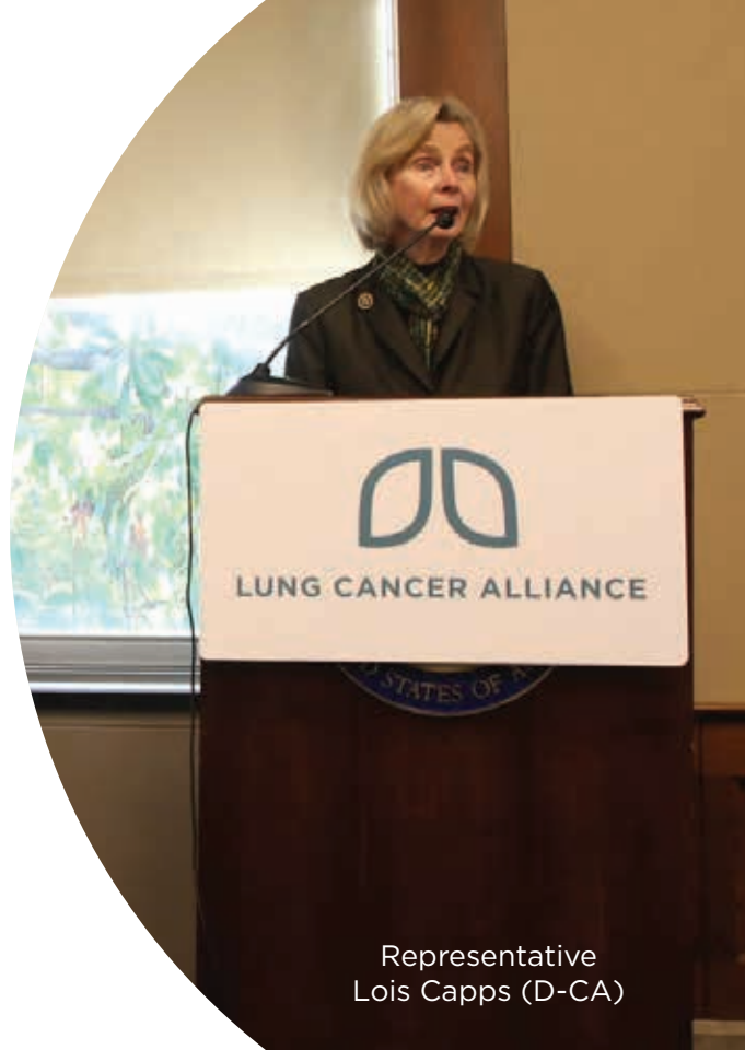
Representative Lois Capps (D-CA)

with the caucus to educate our leaders about the disease, secure more research funding and expedite early detection and treatment breakthroughs.